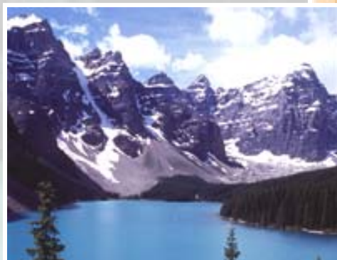
MORaine LAKE AND VALLEY OF THE TEN PEAKS