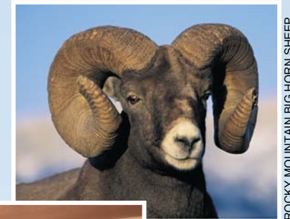
ROCKY MOUNTAIN BIG HORN SHEEP